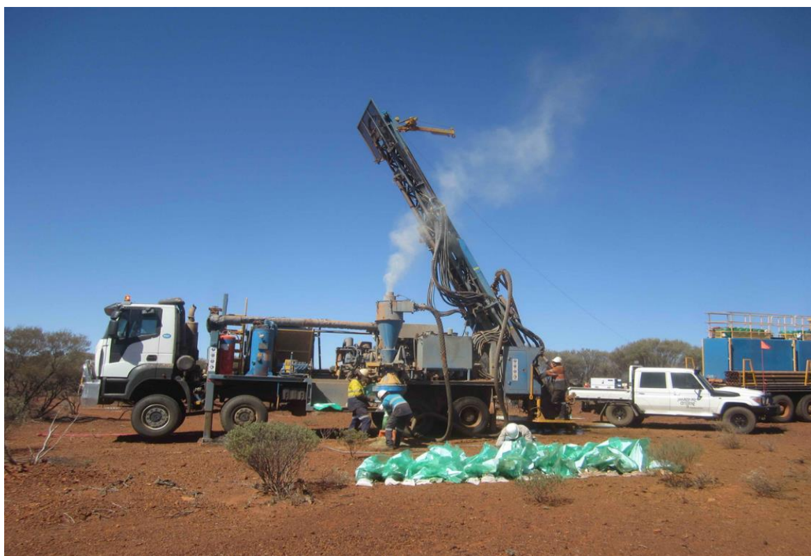
Figure 2 Drilling at Wilconi in April 2019

In addition to the metallurgical work, the drill samples will also be used for specific gravity determinations and ore mineral characterisation studies including XRD, SEM, Energy Dispersive X-Ray Spectroscopy (EDS) and Raman Spectroscopy. Preliminary mineralogical studies indicate much of the cobalt and nickel mineralisation is associated with a secondary manganese oxide mineral dispersed in saprolite clay above the ultramafic contact.