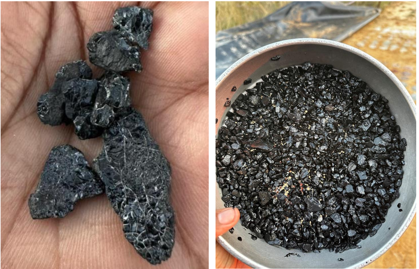
Figure 1. Serowe seam coal rock chips – bright coal with well-formed cleats

“Our support wells are also continuing to dewater efficiently. We are seeing gas build-up in wells 3.3 and 3.1, which was flared last month. The reservoir is responding and we remain focused on progressing well 3.5B through stimulation and into flow testing towards gas production.”